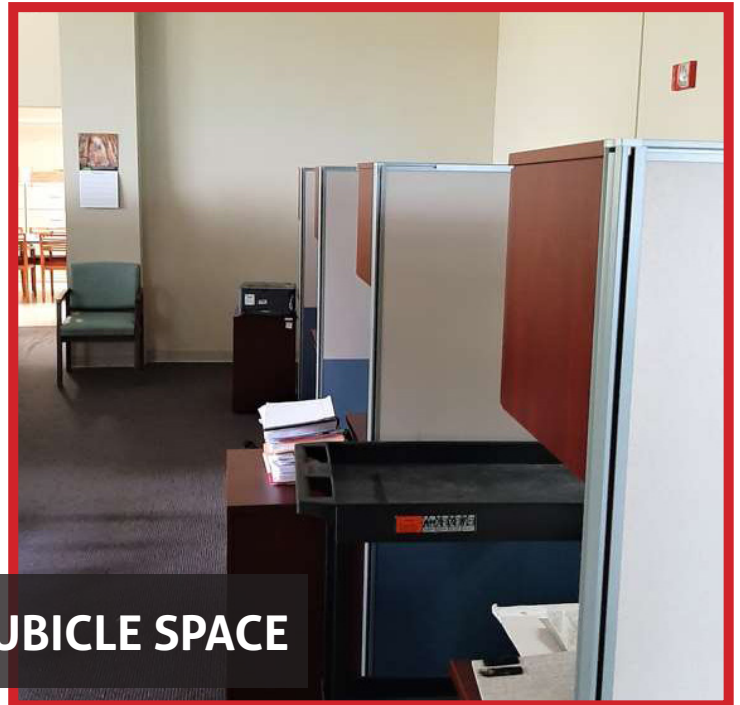
INTERIOR CUBICLE SPACE