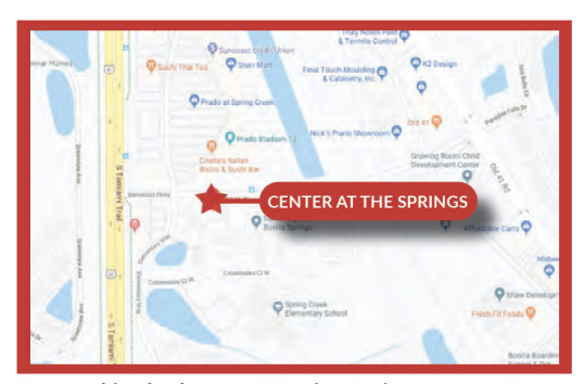
Located in the heart of Bonita Springs across from Bonita Bay, just off US 41 South at the southeast corner of Elementary Way & Bernwood Parkway.